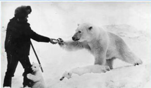
Global warming is too serious for the world any longer to ignore its danger or split into opposing factions on it

agreement that laid out the path to a 100% clean future. They are now trying to save the Paris deal, and with it all the humanity. Climate change is the kind of issue Avaaz was born to address. According to Avaaz battle plan, we should will neutralise Trump's attack in four points: