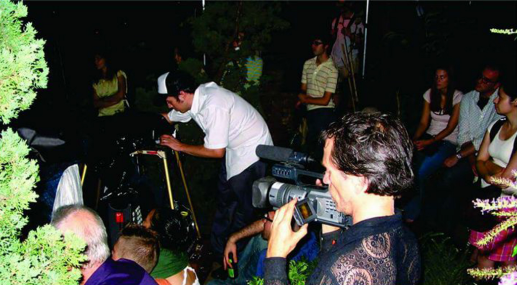
Le Petit Versailles Garden, NY

As the real function of art is ideological, activist and independent artists projects are particularly interesting and meaningful. By 1952, Abstract Expressionism was the art that won the culture war with Europe. The market creates brands but not everyone is thrilled. For many artists tired of abstraction there was no chance to exhibit. I am referring to those to painting people and nature, tell stories, try out crazy new forms that merged art and theater or politics and art expression of it, was of primary concern. The only guaranteed way these artists could achieve their goals was by opening galleries of their own. So they did. And doing so, East Village became one of the more radical NY location for arts and culture. Environmental sustainability was soon a flag for resistance spaces. In this context was created Le Petit Versailles (LPV), a NYC public community garden in the East Village that presents a season of events including art exhibitions, music, film/video, performance, theater, workshops and community projects from April/May - October/November. ( http://lpvtv.blogspot.com/es/2006_08_01_archive.html )